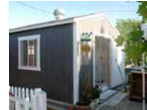
852 Dogs Rescued

Kennel Remodel: HP volunteer team builds west fence creating property boundary