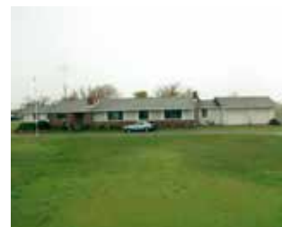
402 Dogs Rescued

The current Elverta property is leased; Jody lives alone in a trailer for weeks; Not a single fence post; Dogs are housed in a metal barn