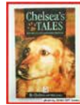
454 Dogs Rescued

Golden Touch: A Senior to Senior Connection Program established to help place golden olides: First Kibble & Bids™ event