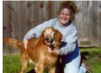
403 Dogs Rescued