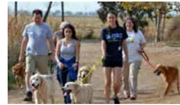
711 Dogs Rescued