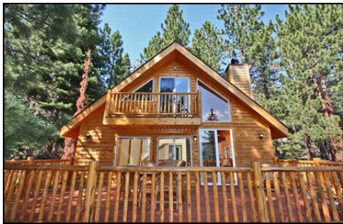
Tahoe Luxury Home

You'll also be tempted by a number of fantastic live auction items, such as eight days and seven nights in a luxurious home at Tahoe's Heavenly Valley. Along with spectacular views of the Sierra Nevada Mountains, amenities include a hot tub, sauna, and Scandinavian cold dip pool. Other vacation offerings include Meadowood Napa Valley Resort, a ridgetop retreat in the Anderson Valley wine country, a Lake Tahoe luxury vacation home, and a Penthouse condo in Los Cabos, Mexico.